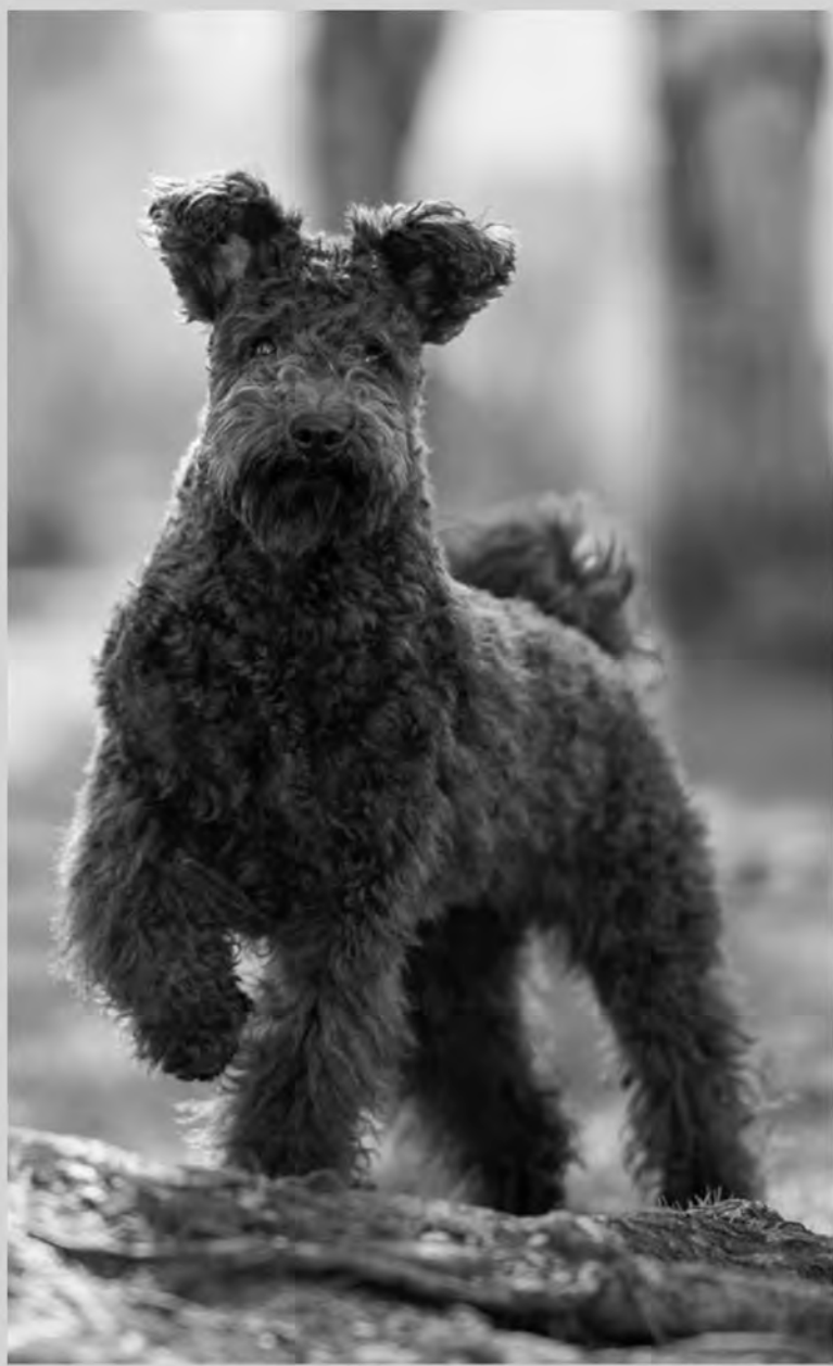
GCH HEGYALJAI SZERENCSE'S MUSKOTÁLY America's #2 Pumi - #1 Bitch (All-Breed)