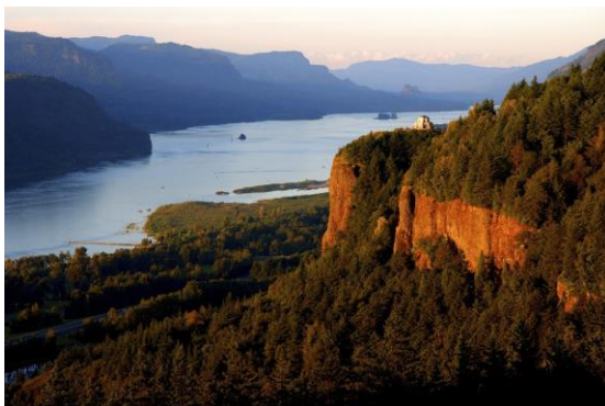
Columbia River Gorge