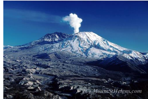
Mount St. Helens