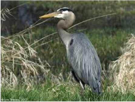
Ridgefield National Wildlife Refuge