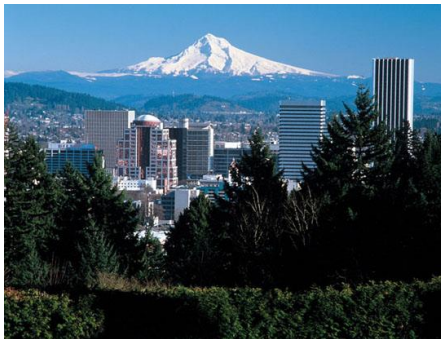
Portland & Mt. Hood