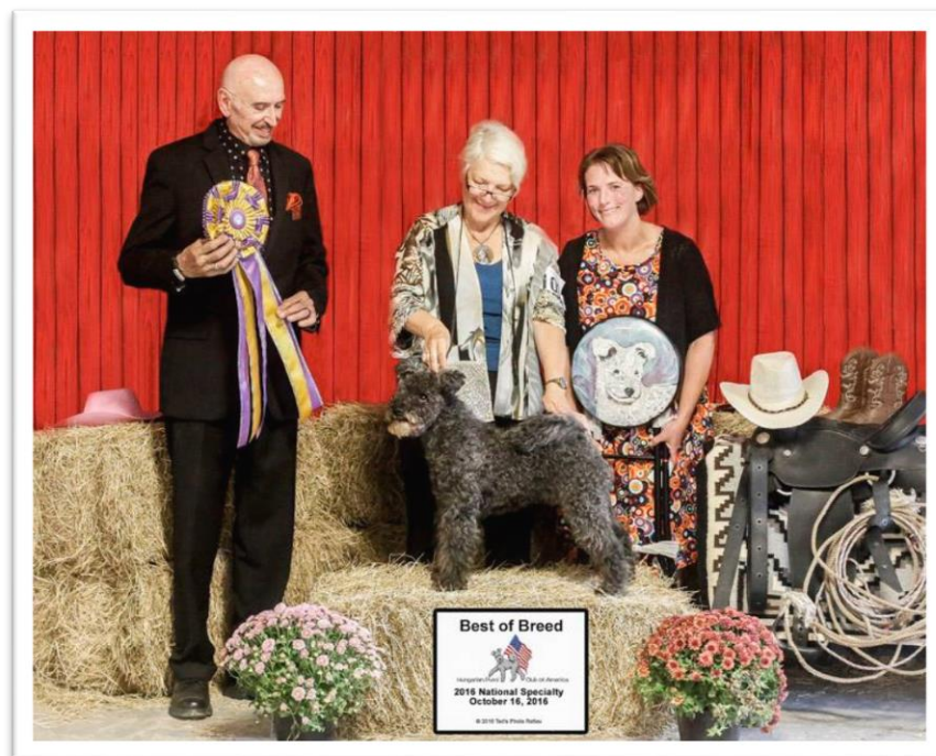
Pumifest Best of Breed

This article appeared on the web site http://www.dogbreedhealth.com/