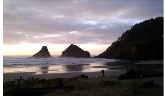
Oregon & Washington Coasts