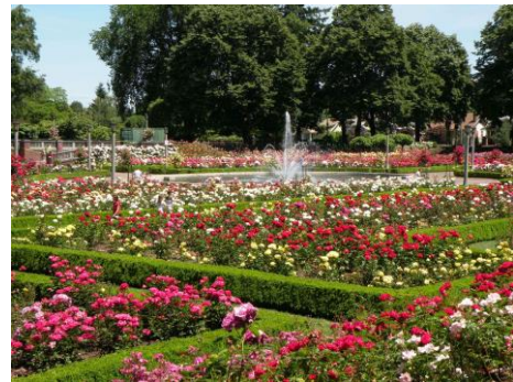
International Rose Test Gardens