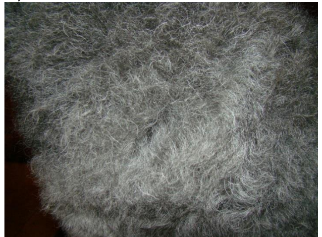
Figure 9: Combed-out coat - body hair