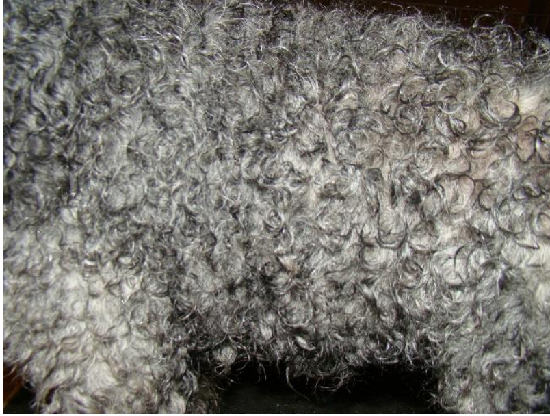
Figure 10: The appearance of the coat after combing out and then spraying down

The only way to restore the characteristic Pumi hair tufts is by wetting down the hair, either through bathing or by spraying the hair using a spray bottle, wetting it down to the skin. My first mentor in Hungary told me many years ago that the best Pumi coat is obtained by letting the dog go swimming (in clean water!) over several days, and this was confirmed by a Pumi owner who trained her Pumi in dock diving and her Pumi was getting soaked down many times a day.