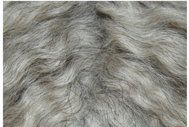
Figure 5: An even distribution of harsh and soft hair on the leg

As stated in the 1966 standard, too much of the soft undercoat will make the coat tend to mat. Puppy coats usually have much more soft coat than harsh and can be more difficult to keep up, so need to be combed more often. The adult coat may not appear until approximately 3 years of age.