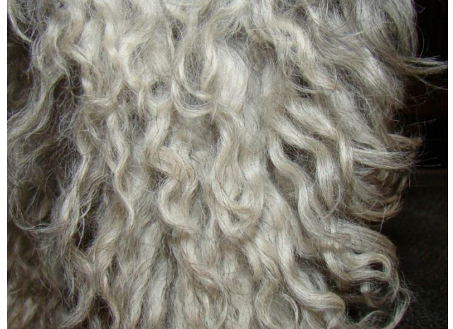
Figure 3: Curls on the legs