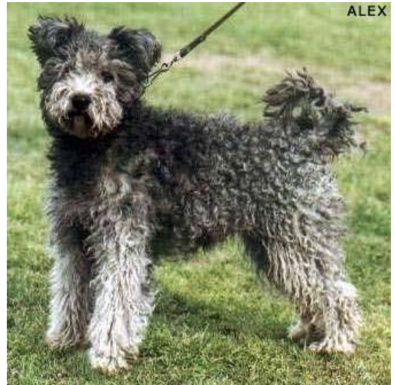
Figure 1: Anghihazi Borbolya

The coat of the Pumi is quite unique. It consists of a rough top coat and a finer undercoat in a 50-50 ratio. Compared to the Puli the Pumi coat is generally rougher but has more variations. The whole body is covered by shaggy rough fur. The preferred coat is the harsh type since that contains the least quantity of wooly undercoat. Longer plaited coats contain a higher percentage of fluffy hair but even those never felt or mat, not even on the hindquarters or thighs. The hair is shortest on the paws and on the muzzle, so that the eyes and nose are always visible.