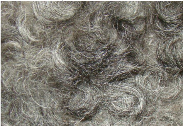
Figure 4: An even distribution of harsh and soft hair on the body

You can see in the photos below that mixture. This should be true no matter what color the coat.