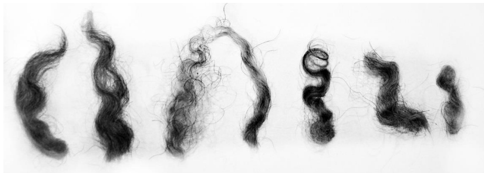
Figure 6: Tufts vary in type all over the body

A proper Pumi coat forms these tufts of hair when allowed to dry naturally. The following is a photo of some of these tufts from the same dog on different parts of his body: