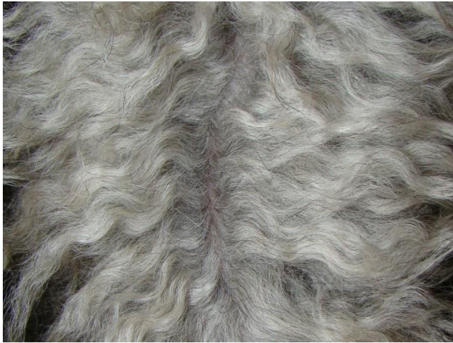
Figure 7: The tufts form clear down to the skin

These tufts are apparent clear down to the skin, not just at the tips of the hairs. The only way these tufts will form properly is if the coat is entirely wet down to the skin and allowed to dry naturally. You can see the skin at the base of the tufts on the photo below.