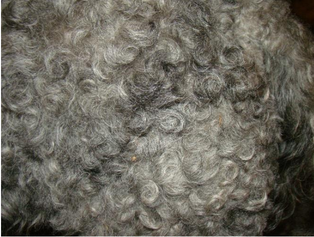
Figure 2: Curls on the body

These waves and curls vary all over the body as shown in the following photos: